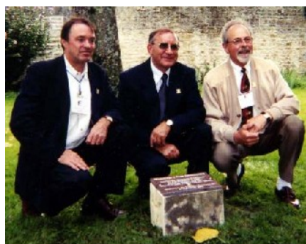
Morissette principals presenting the plaque