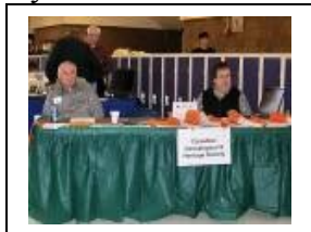
Waiting for the workshops to end